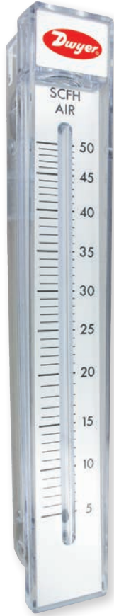
Model RMC 10" scale, 15-3/8" high

Gas Flow from 0.05 to 1800 SCFH, Water Flow to 10 GPM