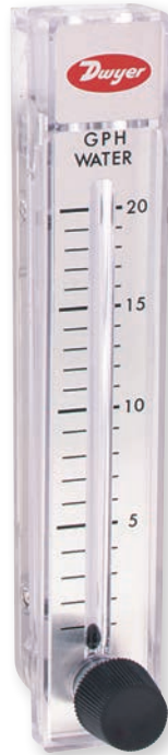
Model RMB-SSV 5" scale, 8-3/4" high