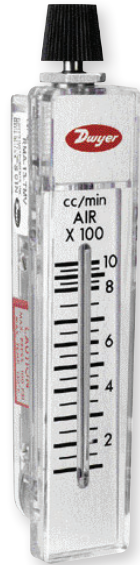
Model RMA-TMV 2" scale, 4-13/16" high