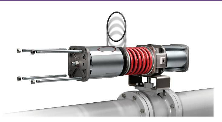
Allows for all seals to be replaced in the field while the actuator is still mounted to the valve