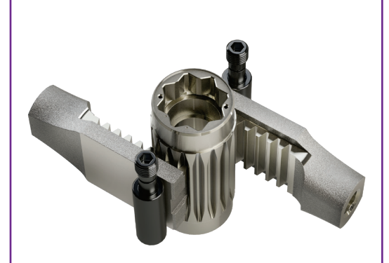
Extremely low internal friction, minimal air consumption, and able to handle severe vibration