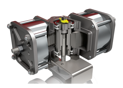
"Close Mount" design reduces size, weight and cost by passing the valve stem through the actuator shaft