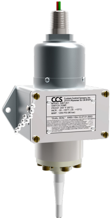
Capillary not shown.