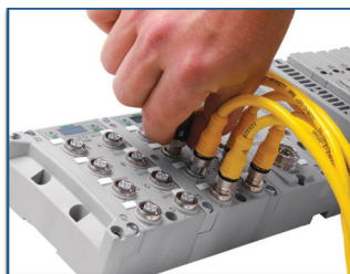
Easy, Robust Connections