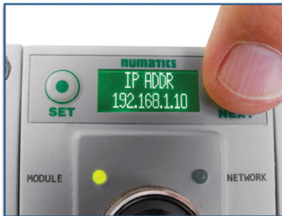
Graphic display for configuration & diagnostics