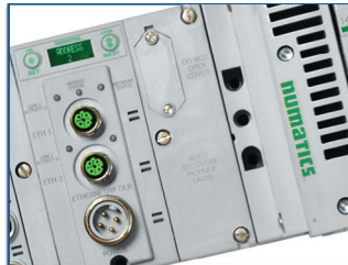
Auto Recovery Module