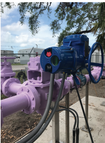
Valves used in reclaimed water service Dunedin, Florida