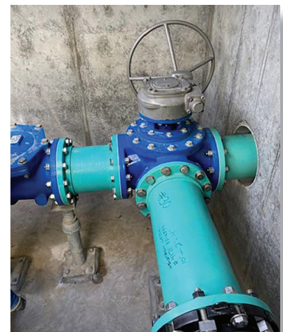
Valves used in a wastewater lift/booster station Carlsbad, California