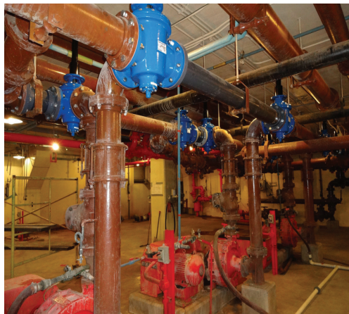
Valves used on the digester at the Hampton Roads Wastewater Plant Mount Crawford, Virginia